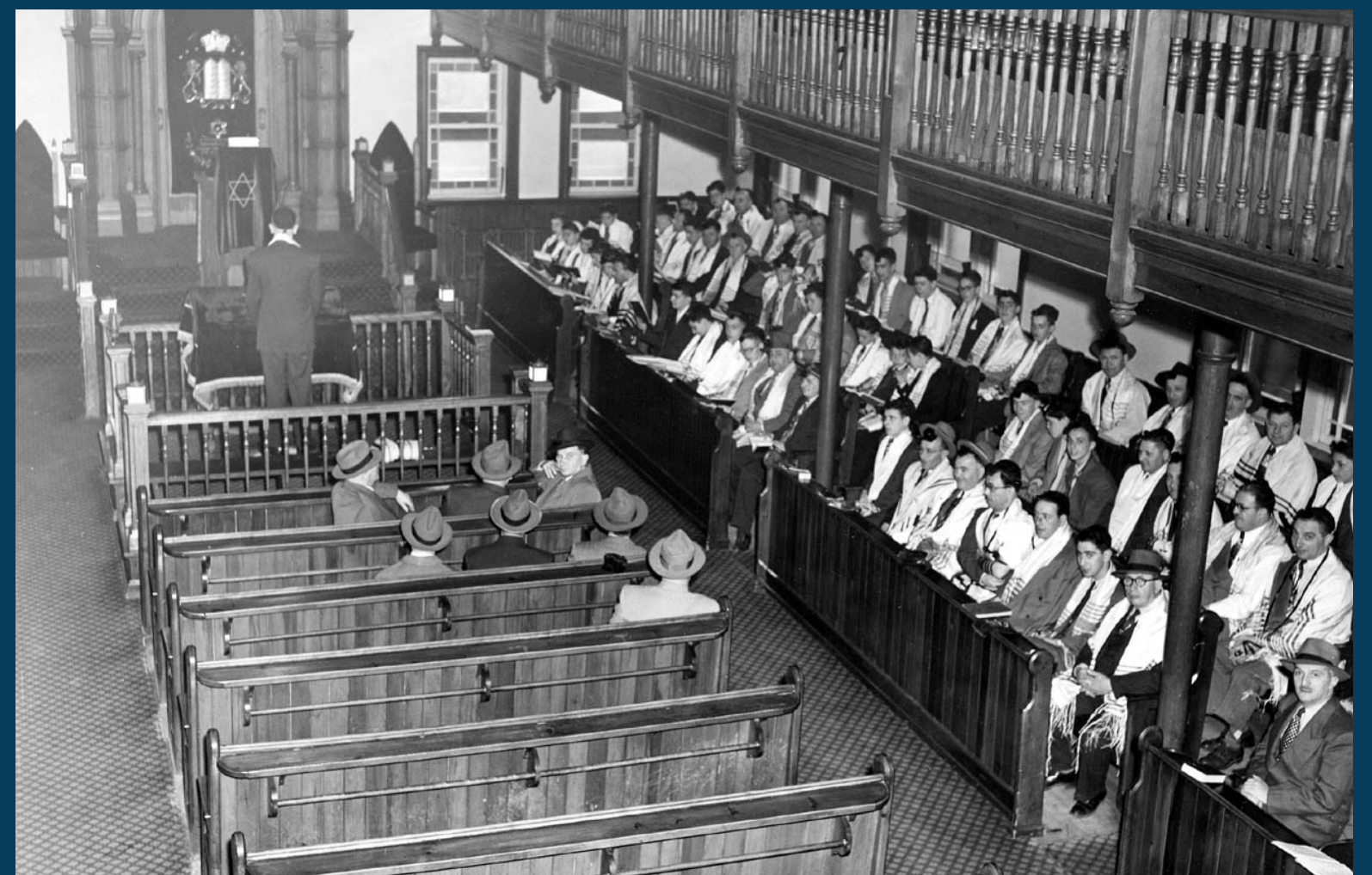
Hanoar study breakfast club annual father and son session and oratorical contest at Adath Jeshurun Synagogue, May 22, 1949.