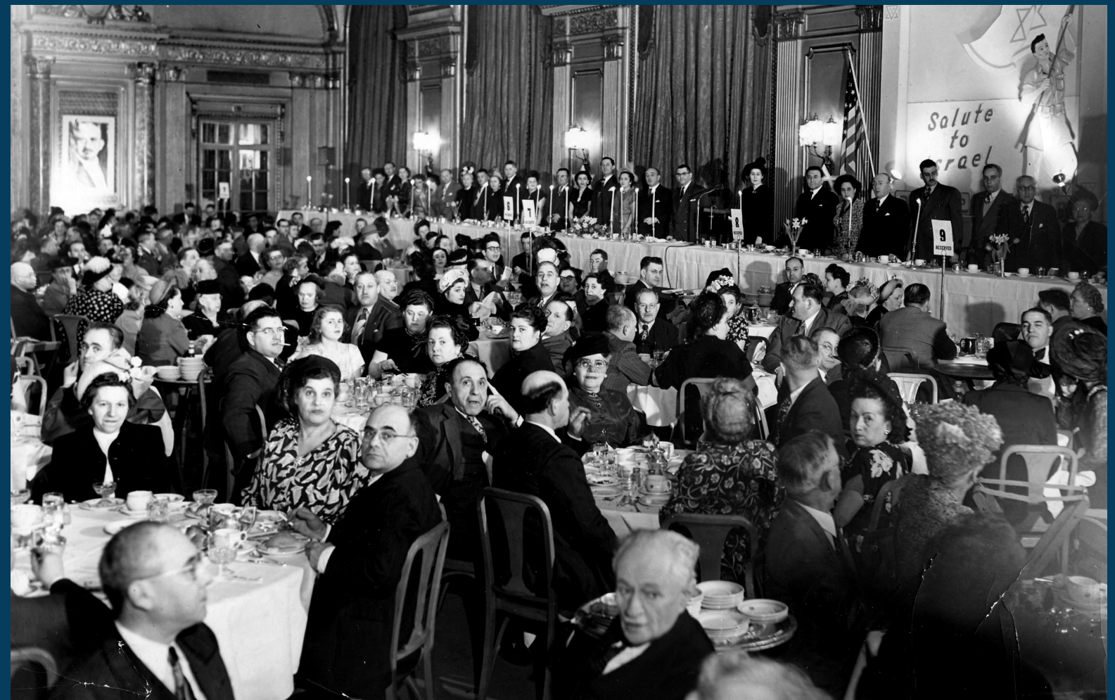
Ottawa Silver Jubilee Banquet Salute to Israel, 1949.

The first copy of the Ottawa Jewish Bulletin was published on October 22, 1937. In its early days, the Bulletin was a four-page report published every Friday and roughly 800 copies were mailed out to the Jewish community of approximately 3500 people.