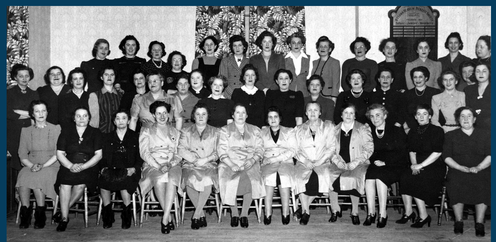
Red Cross Sewing Circle, 1948.