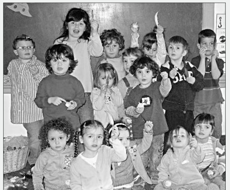
A few of Temple Playhouse children pose while searching for chametz before the school Seder