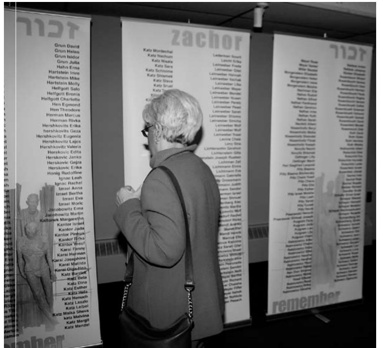
Community members pause to view the memorial

"The memorial serves as a headstone to give honour