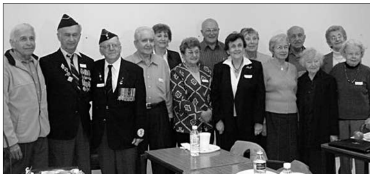
Pictured above are some of the survivors who shared their painful memories at the Holocaust student seminar held at Mohawk College.

"I felt honored to have been given the opportunity