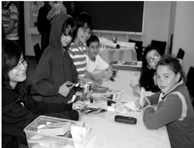
Beth Jacob students enjoy Israel art project at its recent open house.