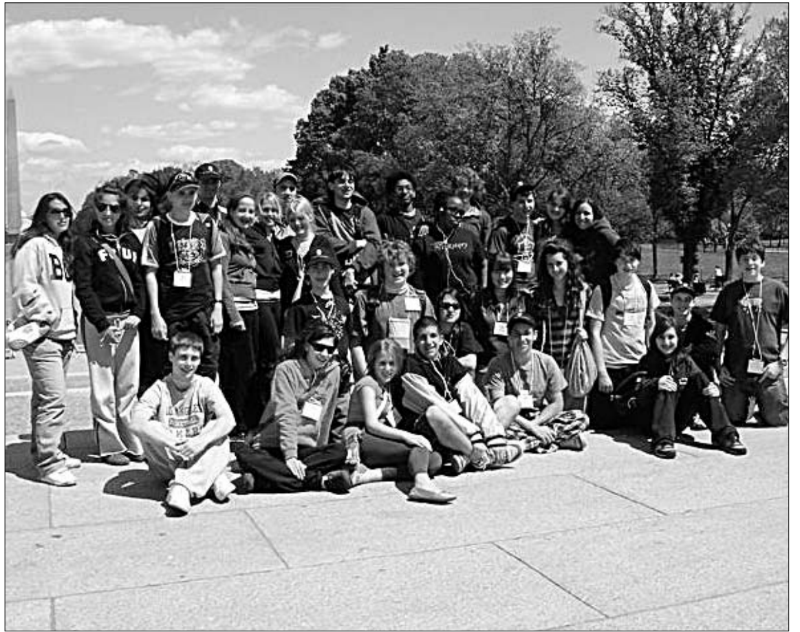
Pictured above is most of the Hamilton delegation of 68 who participated in the Asper Foundation Human Rights and Holocaust Studies trip to the United States Holocaust Memorial Museum in Washington, D.C. in early May

The response from the students was overwhelming and eighteen area high schools par-