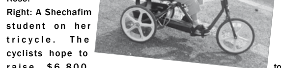
Right: A Shechafim student on her tricycle. The cyclists hope to raise $6,800 purchase two adaptive tricycles and helmets.