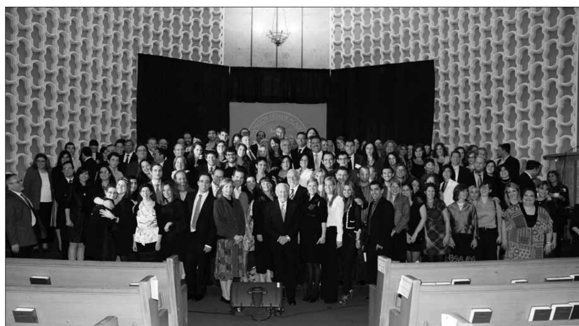
Approximately 200 Hamilton Hebrew Academy alumni and 60 past and current teachers attended the recent 50th anniversary gala reunion.

Some hadn't seen each other in 35 years. Groups of middle-aged men and women sat together around tables as they once did as children. Yet they all shared one common feature – a smile from ear to ear – as they reminisced about some of the greatest days of their lives at the Hamilton Hebrew Academy Gala 50th Anniversary Reunion on May 15.