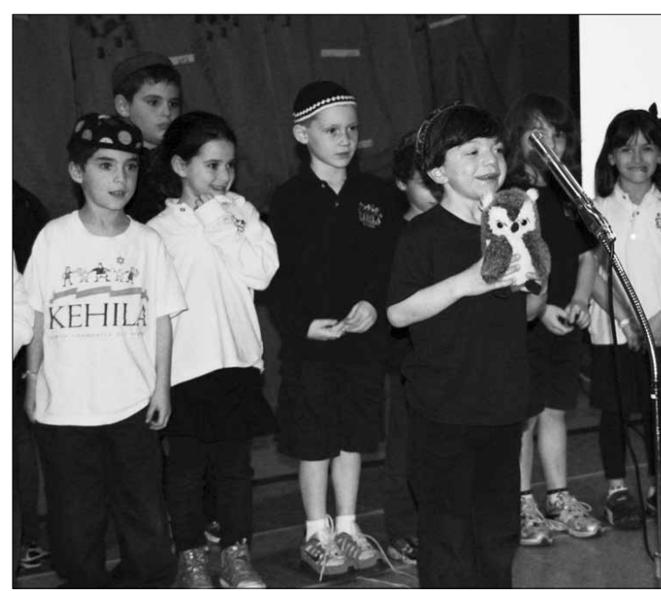
Grade One students recite a Hebrew poem at the annual Israel Studies Avigal Presentations at Kehila.