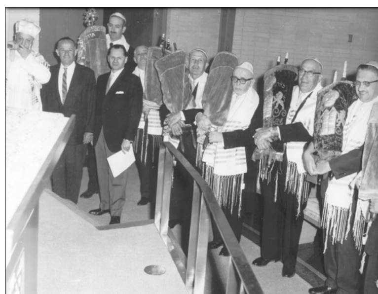
A scene from the 1961 inaugural ceremony celebrating the opening of the Adas Israel Congregation.

Fifty years ago this autumn, the doors of a brand new Adas Israel Congregation were opened in Westdale.