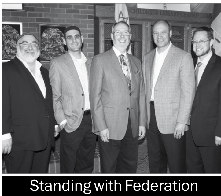
Standing with Federation