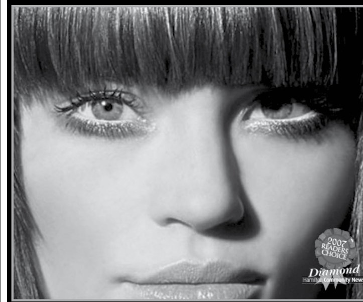
2011 PEOPLE'S CHOICE Diamond BEST HAIR DESIGNER

EXCLUSIVE TECHNIQUES | DESIGN | IMAGINATION