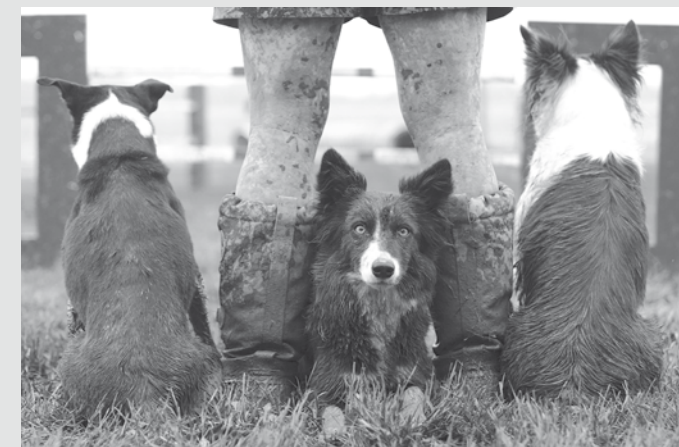
"I'm so fortunate that my vet highly recommended McCann Professional Dog Trainers!"

Discount rates available for B'nai Brith members. Plan underwritten by Novex Group Insurance