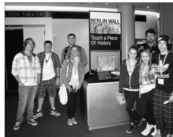
Students from the Asper Foundation Human Rights and Holocaust Studies program at the United States Holocaust Memorial Museum in Washington, D.C. This year a record 83 students participated in the bi-annual program.