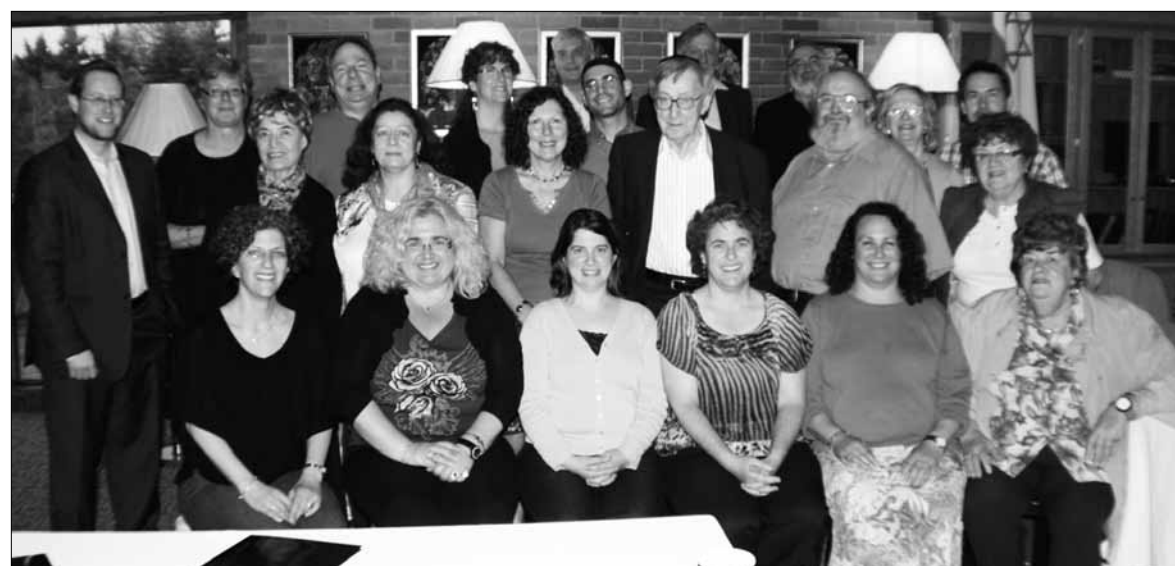
Melton Mini-School graduates at their closing event in May.