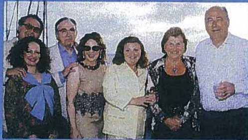
Members of the Canadian and Australian Jewish community at the Top Gifts Mission to Australia and New Zealand.