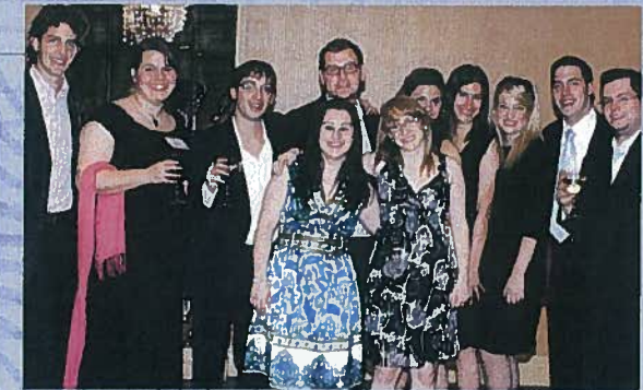
Students from across Canada attended the Canadian Federation of Jewish Students Inaugural Congress.