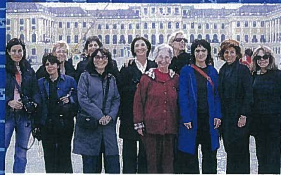
Lion of Judah Mission to Vienna and Budapest.