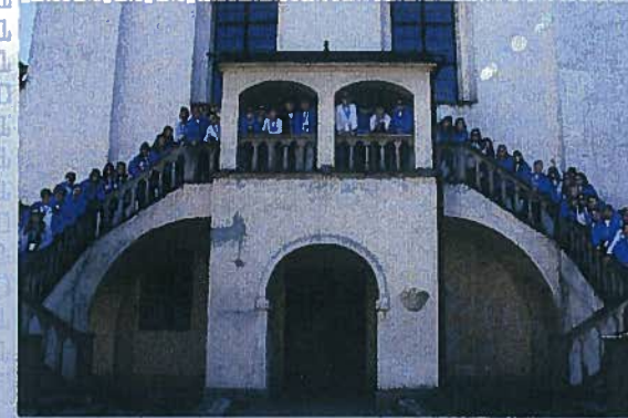
2009 Toronto March of the Living participants outside the Isaac Shul in Krakow.