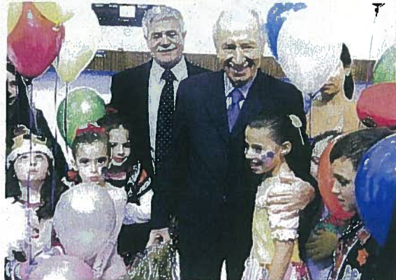
President Shimon Peres visited the Canada Centre in Metulla for Chanukah celebrations.

In 2008, Metulla's Canada Centre underwent impressive renovations—just in time to welcome President Shimon Peres for a Chanukah celebration with members of the northern periphery community. The Centre is expecting to attract more than 120,000 guests with its expanded spa facilities, redesigned lobby and energy efficient features. The renovations are part of a larger plan to grow the popularity and success of the Centre.