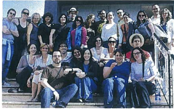
National Initiatives for the Next Generation (NING) organized a Professional Development Mission for young Canadian Jewish community professionals in Cuba.

UIA of Canada recognizes the need to invest in young and talented professionals within the Jewish communal services. As such, this year marked the launch of the first NING Professional Development Mission to Cuba in which 21 Canadian Jewish community professionals participated. One of the outcomes of the mission is the identification of the need for ongoing academic training aimed at retaining our young professionals and positioning Jewish communal work as a career of choice.