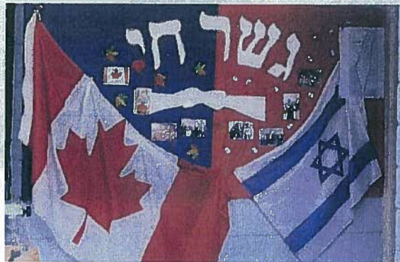
A display at the Nachsonel Hahula school in the Galilee reaffirms the bond between Coast-to-Coast Canada and the Galilee Panhandle.