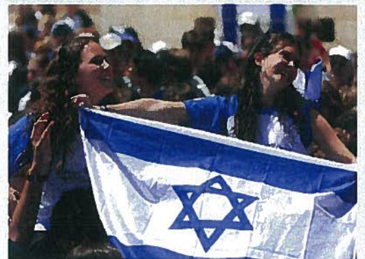
Celebrating Israel's 60th Anniversary at Safra Square.