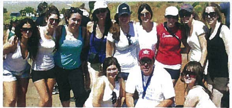
Participants on a recent Taglit-Birthright Israel trip.

CIE programs are making it possible for today's young adults to build a life long relationship and connection with the State of Israel and their local Jewish community.