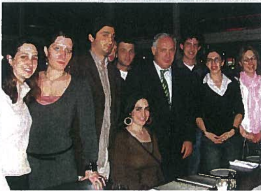
Canadian student delegation meeting with Benjamin Netanyahu at the World Union of Jewish Students Conference in Israel.

National Jewish Campus Life (NJCL) has led a number of inaugural and on-going leadership enhancing programs this past year for both Jewish and non-Jewish campus leaders.