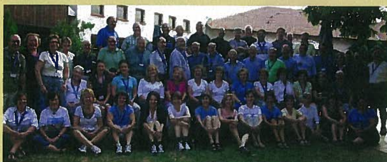
Participants from the Atlantic Jewish Council visit the Galilee Partnership region.

The Regional Jewish Communities of Canada had another successful Campaign year, with Atlantic Canada raising $912,450.99, the Regional Jewish Communities of Ontario raising $655,825.47, the Saskatchewan Jewish Council (Regina and Saskatoon) raising $134,633.55, and the Jewish Federation of Victoria and Vancouver Island raising $25,000. All of these regions showed an increase in the UJA Campaign for 2007—even after last year's Israel Emergency Campaign.