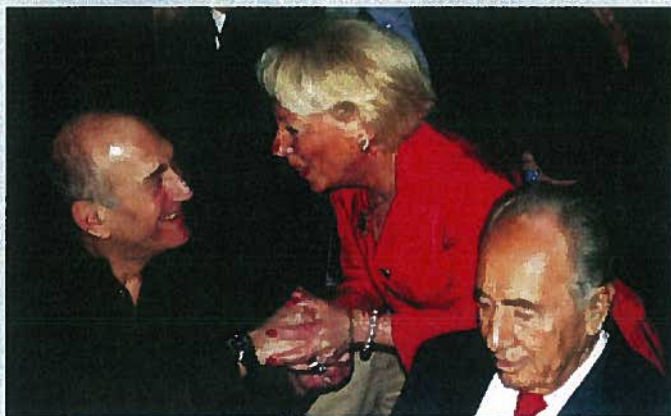
Greeting Prime Minister Ehud Olmert and President Shimon Peres at UIAFC's Yom Ha'Atzmaut Hagiga (After-party).