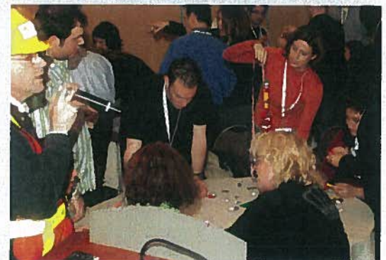
Participants at the INMontréal Conference engaging in a team building exercise.

Other programs from the past year included the UJC Cabinet Retreat in Florida, and the Young Leadership Israel Advocacy Mission to Israel. The Advocacy Mission gave 10 Young Canadian Leaders the opportunity to travel with and learn from a group of Canadian politicians. The program trains our young leaders to be better advocates for Israel, involving them in Canada's political process and helping them form lasting relationships with our MPs.