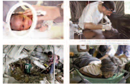
Please help heal the victims and rebuild Haiti

The History of Haiti's Jews: A Jewish presence in Haiti dates back to 1492; the interpreter on Christopher Columbus' ship was Luis de Torres, a Converso. Today, Haiti's Jewish population is approximately 25, centered around Port-au-Prince, the earthquake epicenter. Haiti and Israel have full diplomatic relations.